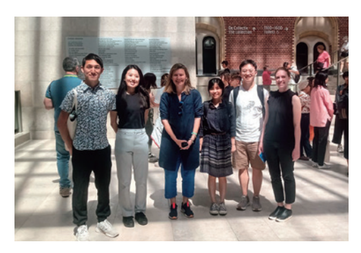
Ishibashi Foundation Digital Futures Project

Ishibashi Foundation 1-7-2 Kyobashi, Chuo-ku, Tokyo 10